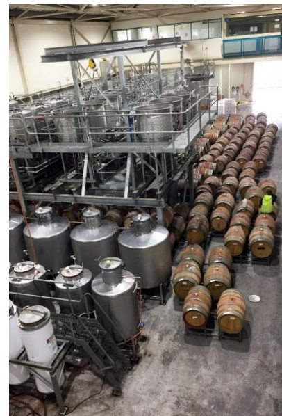
Figure 1. The Hickinbotham Roseworthy Science Laboratory (Winery) at the Waite Campus

Wine science research is aimed at understanding the wine-making process and how it can be manipulated to improve the quality of wines. The research expertise spans the entire wine production chain, from viticulture to aroma and flavour chemistry to consumer behaviour and perception of wine quality. Researchers investigate the sugar: flavour nexus in grape berries during ripening; and analyse challenging compounds arising from grapes, fermentation and ageing. Researchers explore new wine styles and grape varieties; and